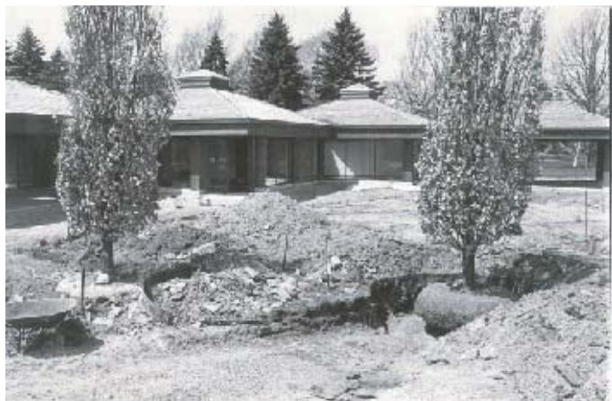
The visitors reception centre mentioned in opposite article nears completion.